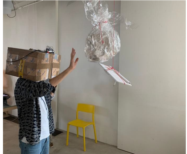
Figure 6: Prototype in action.

By including these 3 objects we attempt to create a playful and interactive environment that invites the participant to explore it.