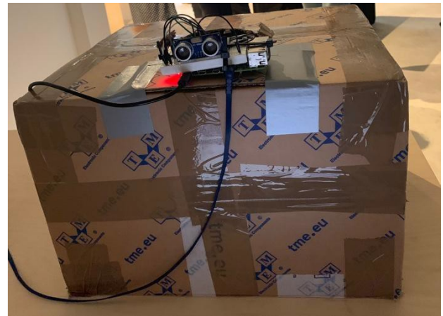
Figure 3: Image of Sonar apparatus

The experience we created during the Summer Camp 2019 in the space of CATCH in Helsingør consists of the following elements: sonar apparatus, and 3 plastic objects.