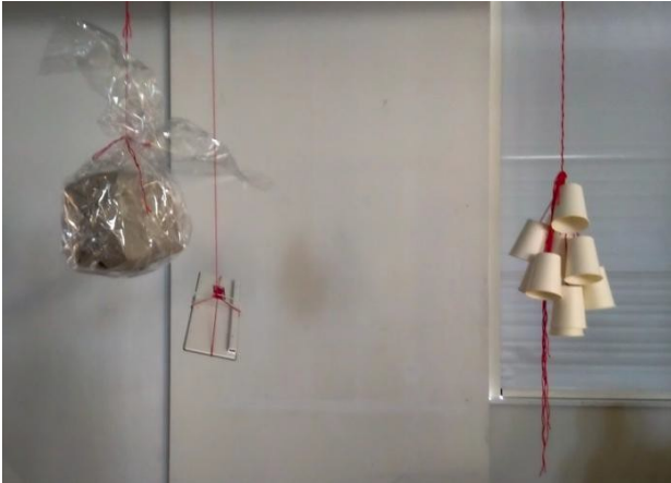
Figure 4: Image of the Environment