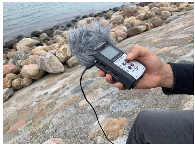
Figure 5: Recording sounds around CATCH in Helsingør, Denmark.

We intended to collage the natural sound source and computer signals as a means to generate soundscape. First of all, we collected sounds (e.g., a helicopter, leaves, birds, seawater and, footsteps) around CATCH, Helsingør and selected sounds of birds and seawater lapping by the small waves since Bio-Sonic Sense is related to the biosphere.